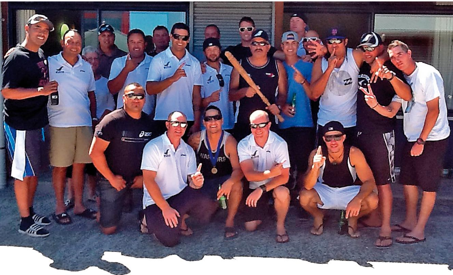
The Black Sox the day after celebrations