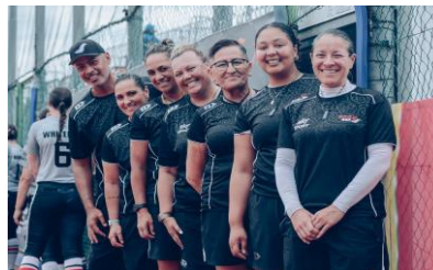
The Management Team