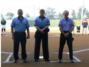
Woman's Final's Crew