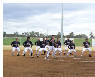
NZ ISA Haka in Final