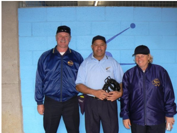
Men' Final Crew

The weather was rather cool during the day but cold at night. Like the women's games the men's were exciting as well. A lot of "Bang Bang" play's. The Kiwi Team's all did well in particular NZ ISA (B) Team whom went through to the final but Loss 5-7 to NSW. There is some really exciting talent coming through, which I am sure they will grace us with there presence in the next few seasons to come.