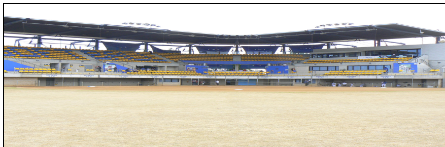
Number 1 Diamond