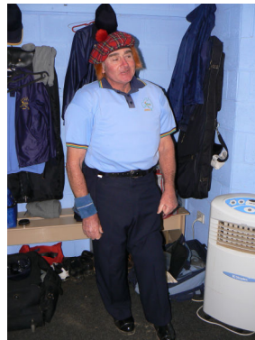
The Aussie Ragga Muffin