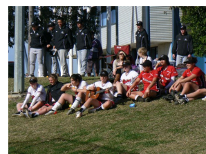
Junior Girls relaxing