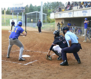
"Hit da Ball"