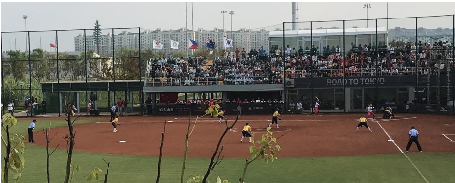
Main Diamond 1