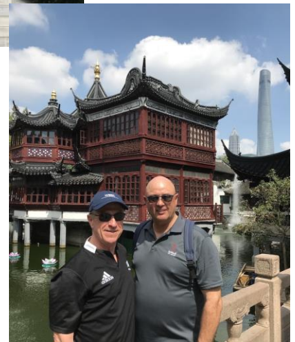
Sight Seeing 1