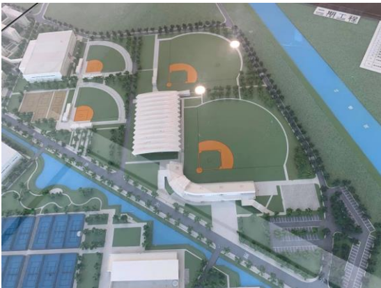
Shanghai Sports Training Centre 1